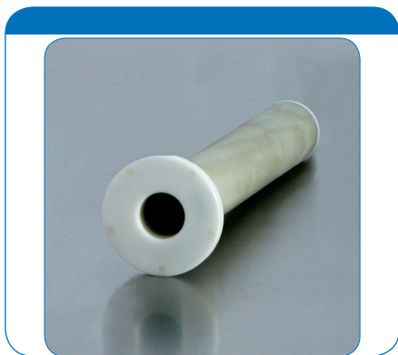
minispec Probe-in-Probe: Unique design to enable measurements on low-weight samples.