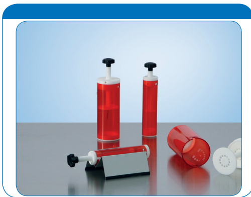
Red Restrainers: while the operator can always watch the animal, the rodent will assume being in a dark place.